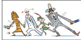
(Bob Staake for The Washington Post)

Next Week: Otherwordly Visions, or Reading Between the Lies